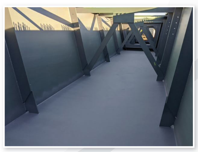
R2P Road Project - Bridge Girders "Finished inside - made from XLERPLATE® steel"